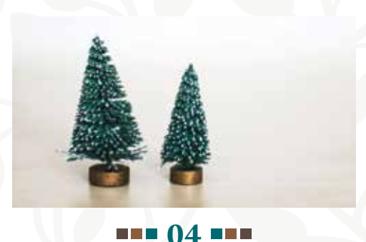
Healing Through Grief Handling the Holidays While Grieving