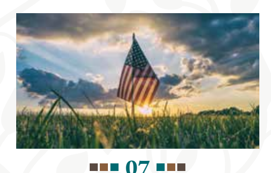
We Honor Veterans Committee Dedicated to Recognizing Veterans