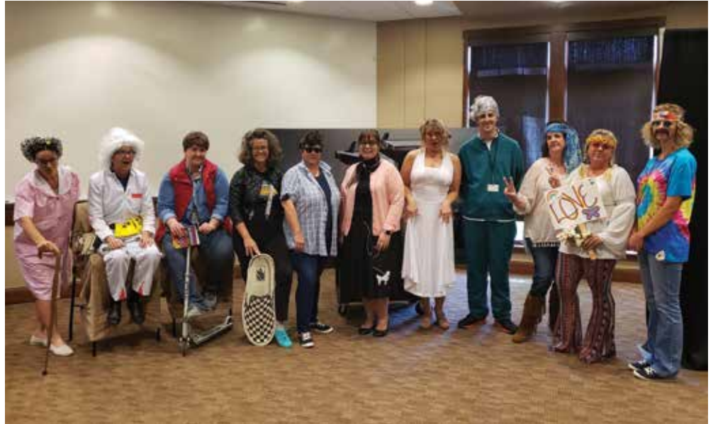
Top: The HopeWest United Way Committee in costume for their United Way fundraising campaign skit based on the movie "Back to the Future."

As a Pacesetter Company, HopeWest, among 32 other local organizations, create themed campaigns to jump-start the annual United Way fundraising goals. The HopeWest United Way Committee created an outstanding performance based on the 1983 movie "Back to the Future." The production was complete with costume, props, sound effects and video that inspired 156 HopeWest